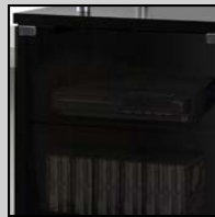
Smoked glass cabinet doors