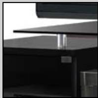
Elevated glass top